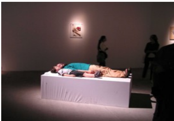
Centre of Attention 'Swansong,' (Mercer Union)

"Culture seems to yearn for some transcendent realm that lies beyond bleak reality, to look through the postmodern patterns that swirl on surfaces into the depths of some Romantic realm that lies beyond".